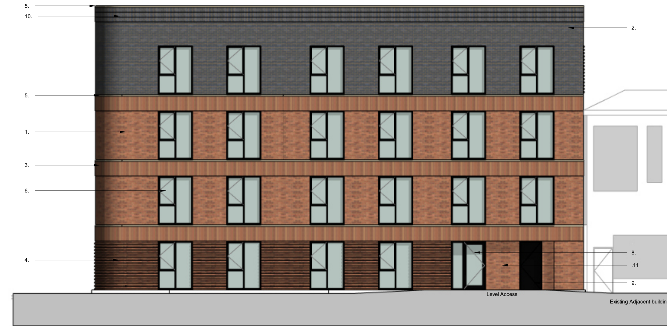
North Scale @ 1 : 100