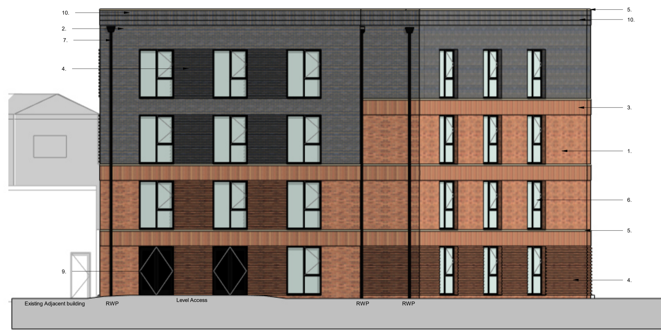
South Scale @ 1 : 100