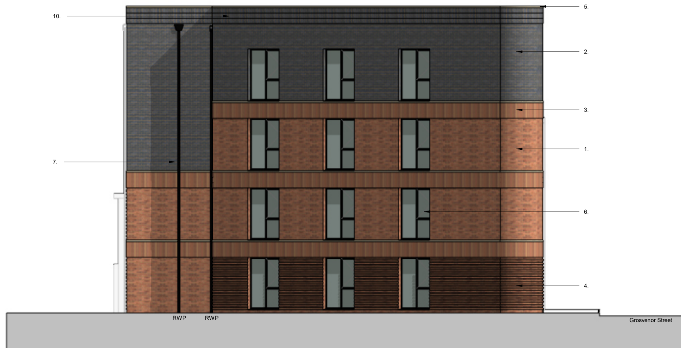
East Scale @ 1 : 100